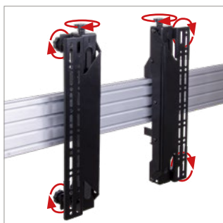
Tool-less micro-adjustment for seamless display alignment