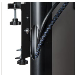
Cable management covers hide untidy cables and add to the stylish finish