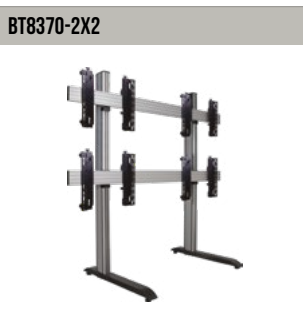
Universal Freestanding Videowall Stand for 2x2 Videowalls