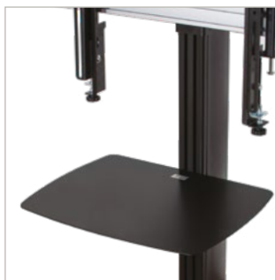
Fit System 2 compatible accessories such as shelves without using collars