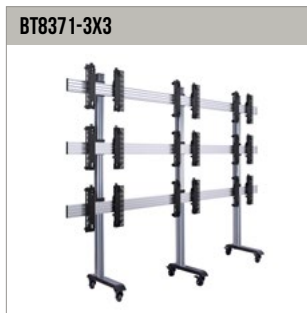
Universal Mobile Videowall Stand for 3x3 Videowalls