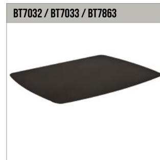
AV Accessory Shelves can be attached directly to a vertical column