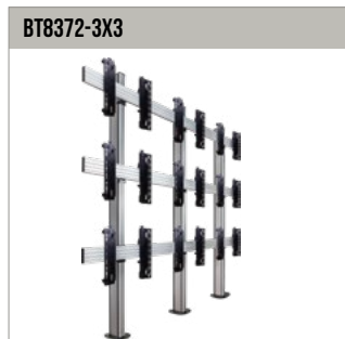
Universal Bolt Down Videowall Stand for 3x3 Videowalls