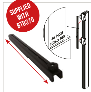
Screen spacer designed to eliminate calculations and guess work when installing horizontal rails

AV AWARDS 2017 MANUFACTURER OF THE YEAR WINNER