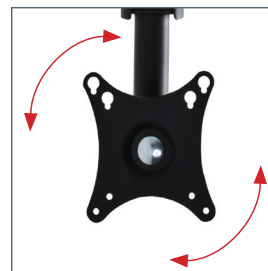
360° screen rotation