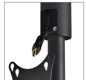
Integrated cable management