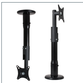
Can be mounted to the ceiling, floor or desktop