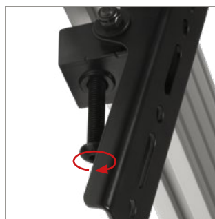
Safety screws help prevent unauthorised removal of screens