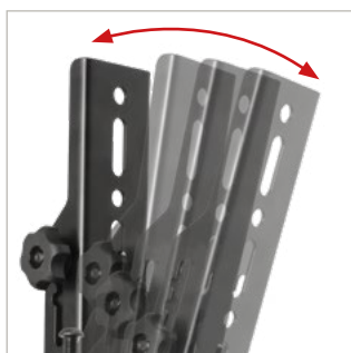
Tilt adjustment of up to +20° for enhanced overhead visibility