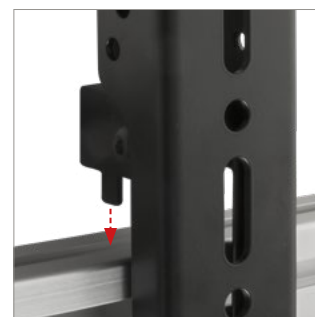
Simple 'hook-on' installation