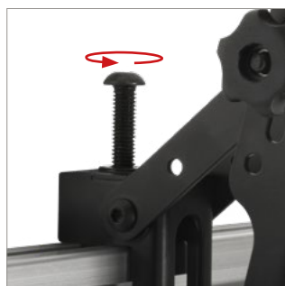
Arms feature levelling screws to adjust the screen height