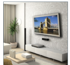
Easy to install in any home