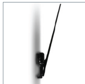
5 fixed tilt positions up to +15°