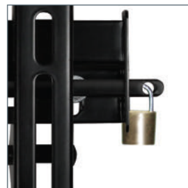
Locking bar for secure installation*