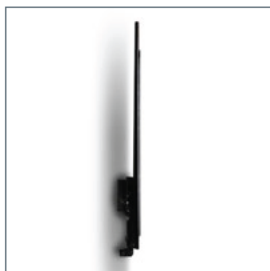
Low profile design mounts screen only 44mm (0.8") from wall