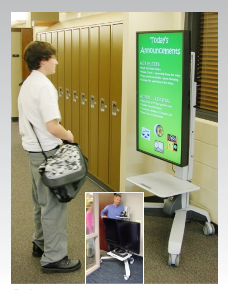
Roll it from room to room