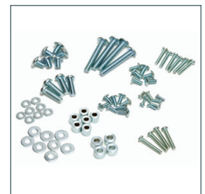
Comprehensive screen mounting kit