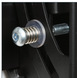
Unique 'Torsion Tilt' mechanism (Patent Pending)