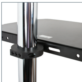
Ideal for mounting accessory shelves to Ø50mm poles