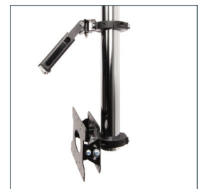
Ideal for a range of mounts and accessories