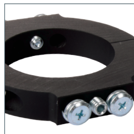
Grub screws provide additional support if necessary