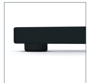
Levelling feet supplied