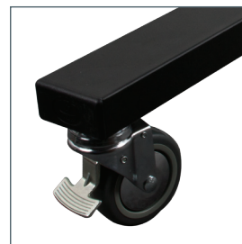
Braked castors supplied