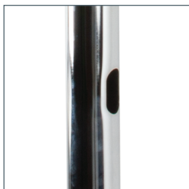
Integrated cable management to hide unsightly cables